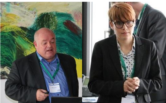
Impressions from the 2 nd Swiss Health Economics Workshop

In September, the institute organized the 2 nd Swiss Health Economics Workshop. Just like the first edition, the workshop has been widely recognized and earned many positive feedbacks from the participants.