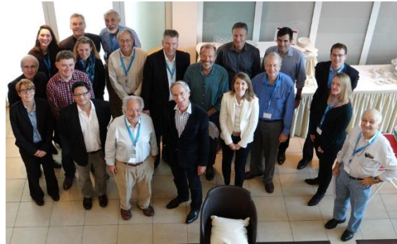
Participants of the 15 th RAN-Meeting 2015

of risk equalization. We used the traditional “sponsor meeting” for an international lecture in risk equalization.